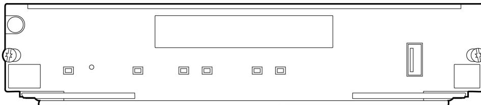
HP MSM765 zl Premium Mobility Controller