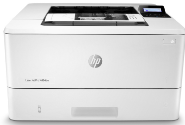
HP LaserJet Pro M404dw

Winning in business means working smarter. The HP LaserJet Pro M404 printer is designed to let you focus your time where it's most effective—helping to grow your business and staying ahead of the competition.