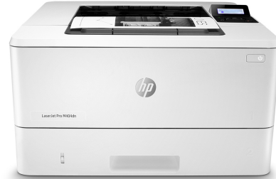
HP LaserJet Pro M404dn

Dynamic security enabled printer. Only intended to be used with cartridges using an HP original chip. Cartridges using a non-HP chip may not work, and those that work today may not work in the future. Learn more at: http://www.hp.com/go/learnaboutsupplies